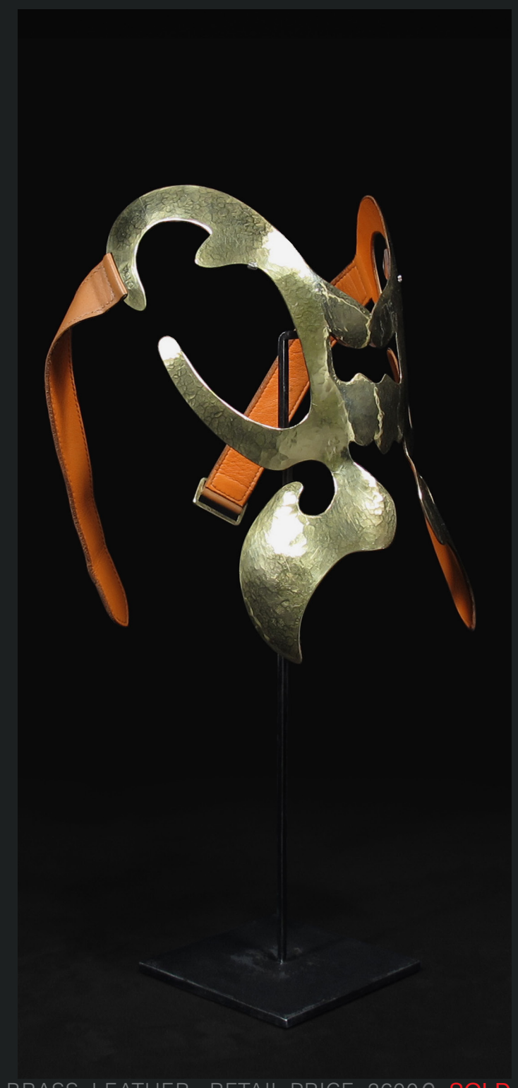
NSECT - BRASS, LEATHER - RETAIL PRICE: 2600€ SOI