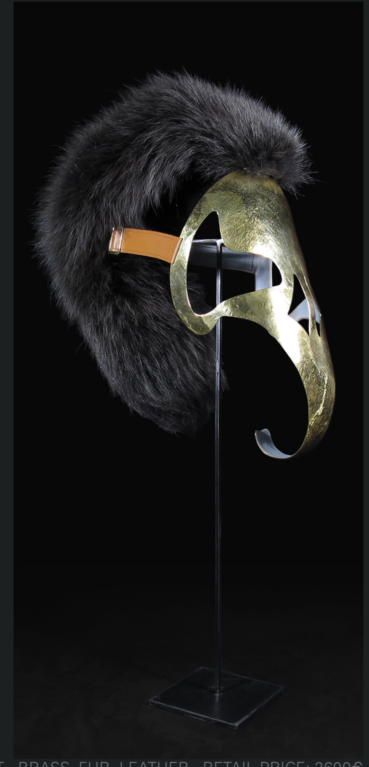
ELEPHANT - BRASS, FUR, LEATHER - RETAIL PRICE: 2600€