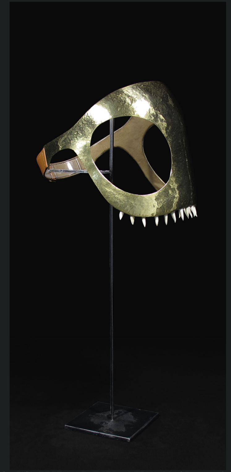
PIRANHA - BRASS , FISH TEETH, LEATHER - RETAIL PRICE: 2600€