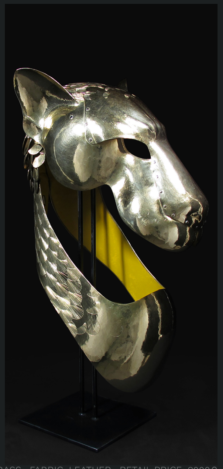
EOPARD-SWAN - BRASS , FABRIC, LEATHER - RETAIL PRICE: 8000€